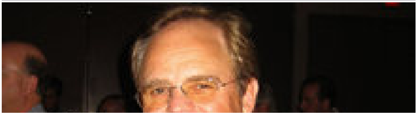
Robe StageQube 324 Wins LDI Award